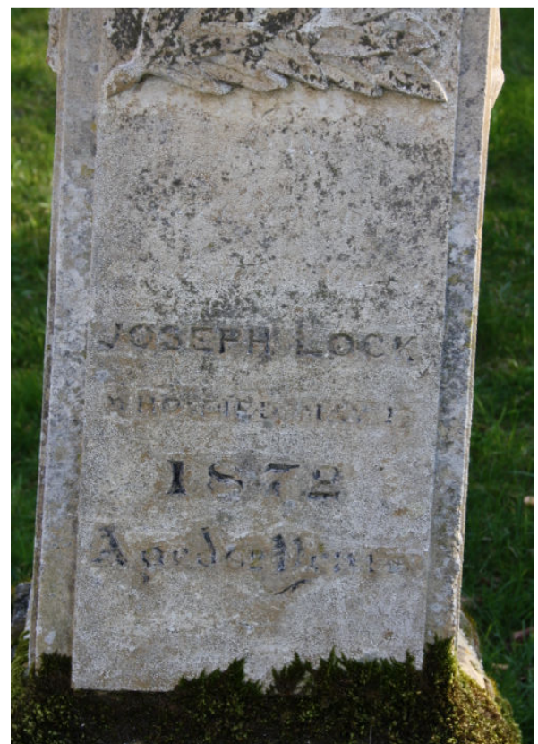
JOSPEH LOCK 1872